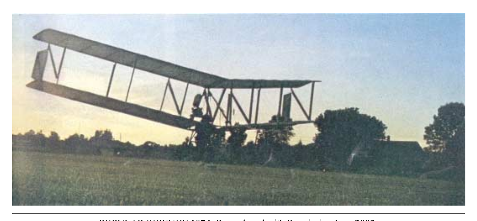
POPULAR SCIENCE 1976. Reproduced with Permission June 2002.